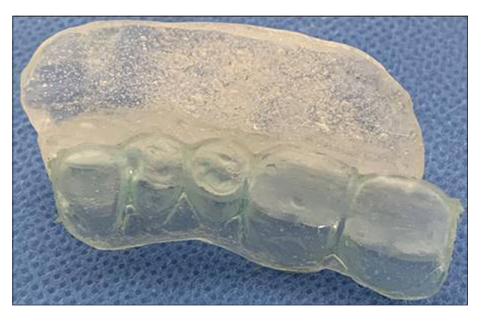
Figure 14: Finished prosthesis

patients still report with impaired mastication.<sup>[7]</sup> Recent advancements in facial reconstructive surgery and osseointegrated endosseous dental implants provide a treatment modality that may adequately rehabilitate oral cancer patients so that they can return to a healthy, productive life.<sup>[8]</sup>