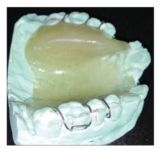
Figure 7: Finished prosthesis