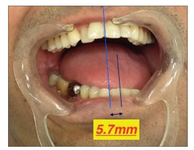
Figure 1: Preoperative deviation