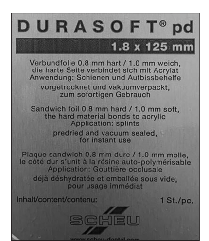
Figure 11: Sandwich foil vaccum formed sheet