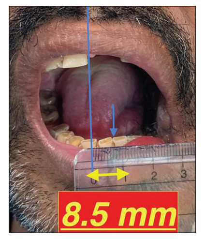
Figure 5: Preoperative deviation

• Three months postinsertion follow-up showed signs of a satisfactory resolution of the deviation.