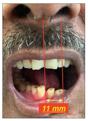
Figure 10: Preoperative deviation

This was then trimmed to be kept from the mesial of the canine to the distal of the second molar and equigingivally. Holes were made on the buccal surface of the adapted sheet to increase the mechanical retention with acrylic. This was placed on the mounted cast and articulator was closed. Clear auto polymerizing acrylic (DPI Clear; Dental Products of India, Mumbai) was adapted and builded up on the buccal surface of the vacuum sheet and superiorly till the gingival level of the maxillary occluding teeth [Figures 13]