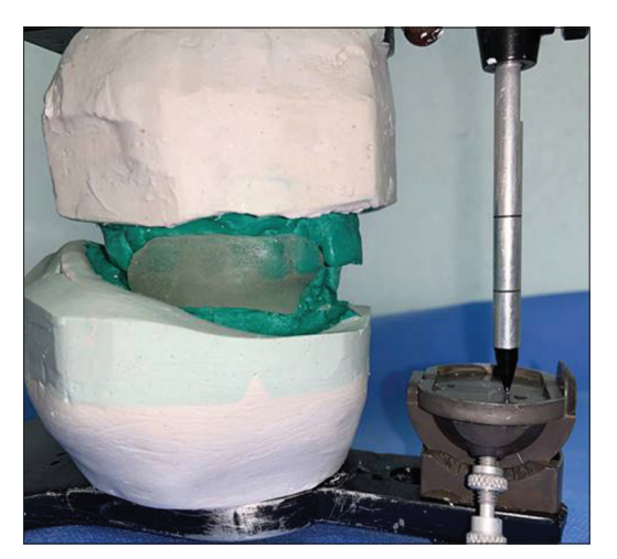
Figure 13: Acrylic flange added after mounting in tentative intercuspation