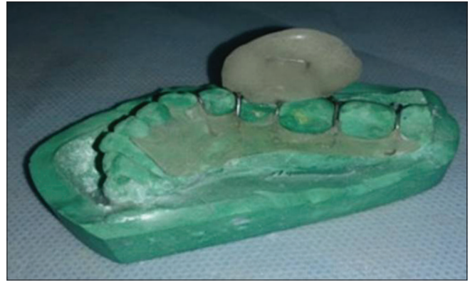
Figure 3: Finished prosthesis