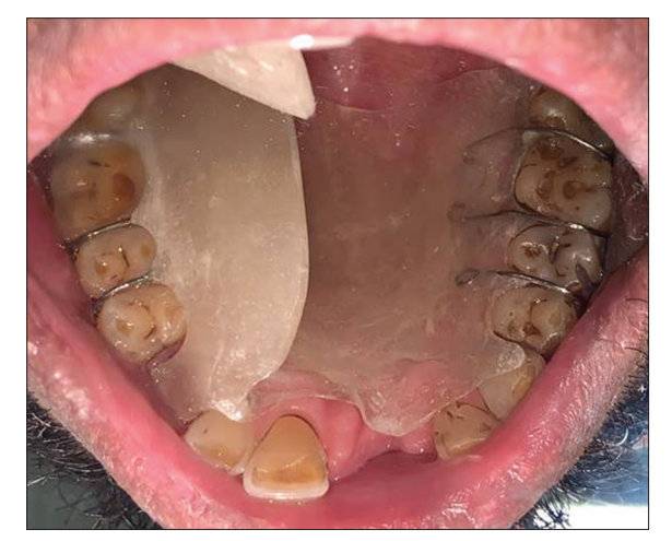
Figure 8: Postoperative intraoral view