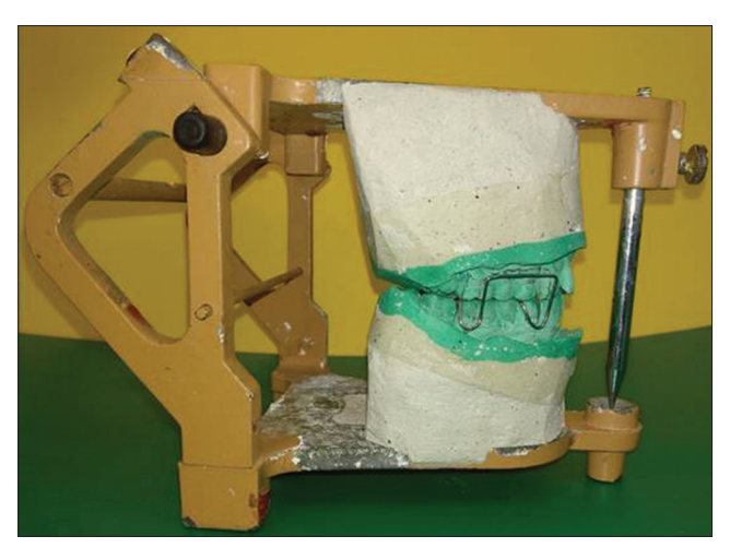
Figure 2: Wire components in casts mounted in tentative maximal intercuspation