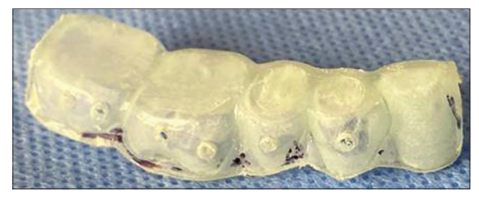
Figure 12: Adapted Durasoft sheet

such as marginal, segmental, hemi, subtotal, or total mandibulectomy are undertaken.<sup>[2]</sup> Mandibular deviation toward the defect side occurs primarily because of the loss of tissue involved in the surgery.<sup>[1]</sup> When a segment of the mandible is removed, immediate reconstruction is usually recommended to improve both facial symmetry and masticatory function. Although techniques for reconstructive surgery and prosthodontic rehabilitation have improved, more than 50% of reconstructed head-and-neck cancer